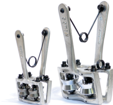
Model LA-CW 1/8" to 5/8" diameter (3.2 to 15.9mm)

At 4 inches wide by 5 inches long (101mm x 127mm), the LA-CW is designed to fit in most ripper boxes. The LA-S is 2-1/2 inches wide by 3-1/4 inches long (63.5mm x 82.5mm) and intended for intermediate boxes or very small ripper boxes.