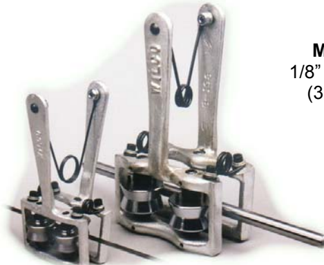
Model LA-CW 1/8" to 5/8" diameter (3.2 to 15.9mm)

At 4 inches wide by 5 inches long (101mm x 127mm), the LA-CW is designed to fit in most ripper boxes. The LA-S is 2-1/2 inches wide by 3-1/4 inches long (63.5mm x 82.5mm) and intended for intermediate boxes or very small ripper boxes.